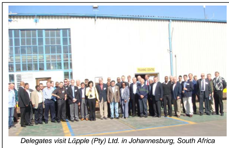
Delegates visit Läpple (Pty) Ltd. in Johannesburg, South Africa

Läpple (Pty) Ltd. ( www.lapple.co.za ) produces automotive body components, systems and assembly components for local OEM's. The plant was very impressive; however it looks more like a stamping department normally found inside a typical OEM's plant than an independent parts supplier.